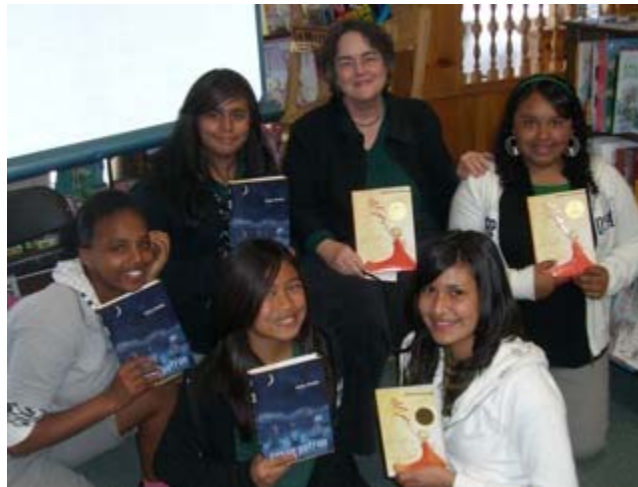
Photographed at Hicklebee's Book Store in California during a book tour after the publication of LUCKY BREAKS in March 2009.